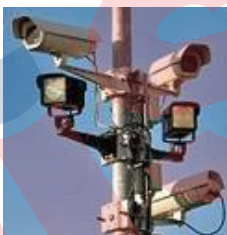
Remote Monitoring & Surveillance