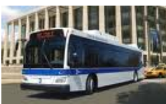
Hybrid Buses & Commercial Vehicles