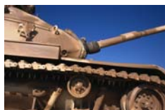
Military & Aerospace