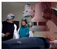
Medical & Dental Equipment