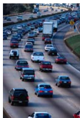
Intelligent Traffic Systems